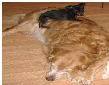
Who needs a bear skin rug?