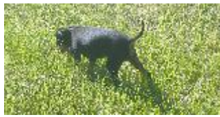
I'm going in a manhunt!